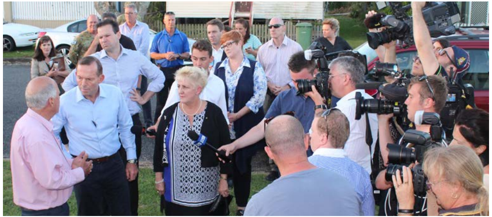
PM Tony Abbott flew north to meet cyclone-affected residents.

of the farms damaged by Cyclone Marcia and then met farmers and foresters from throughout the region at a shed meeting at Yeppoon. (Forests were badly damaged by the wind, something that was very evident when Michelle Landry and I flew over the region to visit smaller communities like Byfield, Ogmoo, Stanage Bay and Marlborough.)