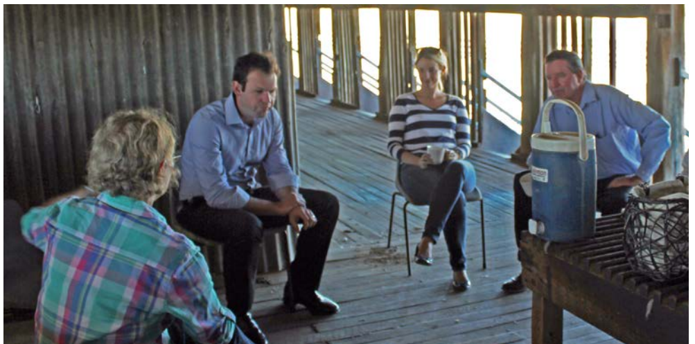
A shed meeting at "Dunraven" outside Barcaldine was a chance to meet local property owners