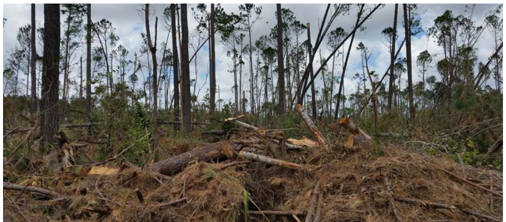
Forests in the Byfield area were devastated.

The losses to the pineapple industry alone are more than $4 million. About 35% of Australia's pineapples come from that region and they are going to be without an income for probably six months at least. Other producers of lychees and mangoes have had their