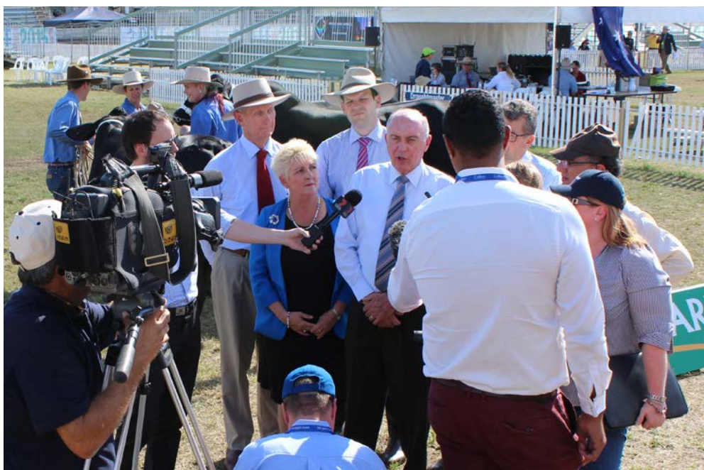
Deputy PM Warren Truss praised the CQ cattle industry at Beef Australia.

If we can make headway on those costs, we can do more to return value to our beef producers and have a stronger beef sector for our nation.