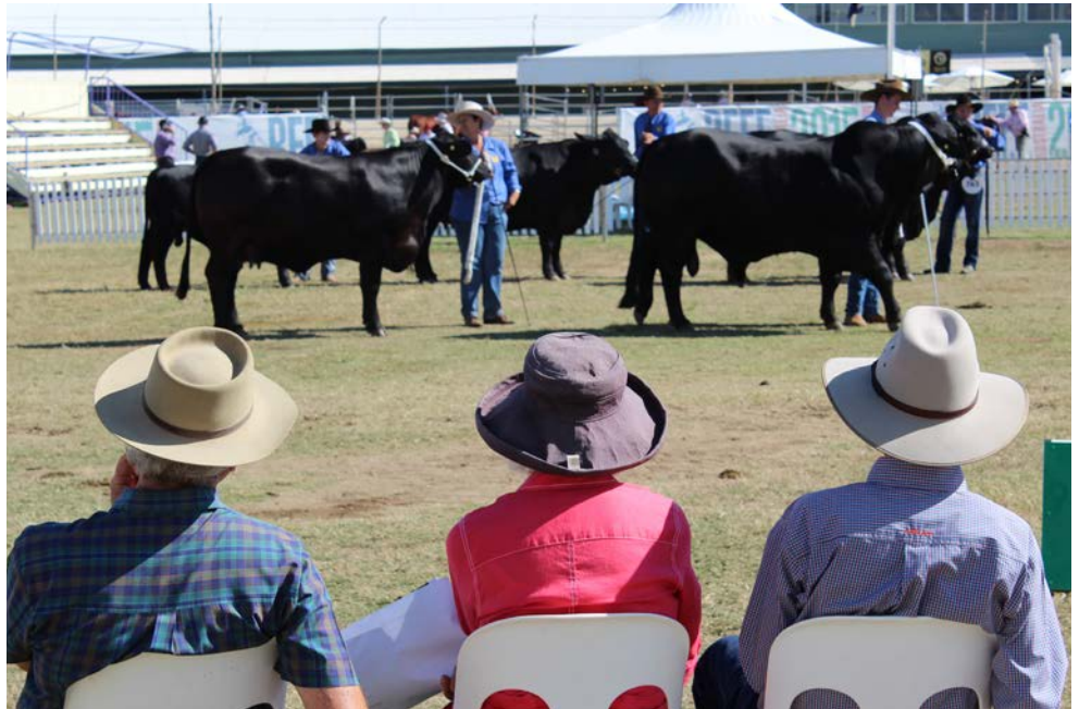
Top cattle fronted the judges at Beef Australia 2015.

This $100 million also is going to leverage a new tool that has been developed by the CSIRO. This tool has the potential to be a revolution for the beef sector. CSIRO use NLIS data from the ear tags that most cattle have. They record when a cow is sold and they have taken that information for 88,000 different transit points – that is farms, feedlots and meatworks – all round the country. On a Google map, they can show you how roads