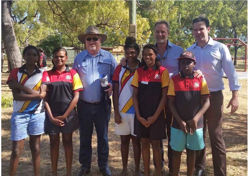
Meeting local school students with Nigel Scullion and Barry O'Sullivan.

I was fortunate to be able to visit Mornington Island earlier this year. I joined fellow Senators Nigel Scullion, Minister for Indigenous Affairs, Fiona Nash, Assistant Minister for Health, and Barry O'Sullivan to meet local residents and discuss a wide range of issues.