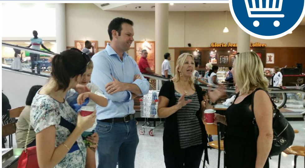
Hearing the views of shoppers, firsthand

The four – Bridget McKenzie (Victoria), Barry O'Sullivan (Queensland) and John Williams (NSW) and myself – made our call in additional comments in the report of a Senate inquiry into the Grocery Code presented in May.