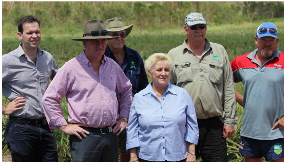
Agriculture Minister Barnaby Joyce joined Member for Capricornia Michelle Landry and me to inspect local farms and meet producers in the wake of Cyclone Marcia (here looking at row after row of ruined pineapples).