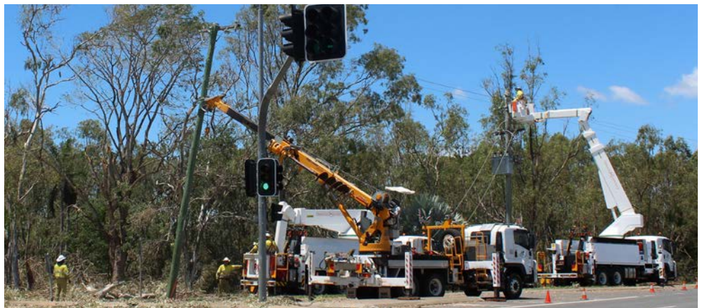
Ergon Energy staff did a fantastic repair job.