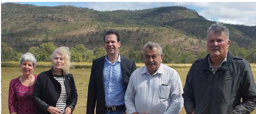
Local residents have talked to me about concerns over a proposed wind farm at Mt Emerald on the Atherton Tableland.

The RET includes biomass as an eligible form of renewable energy generation. This allows waste that would otherwise be burnt or rot on the floor of the forest to generate