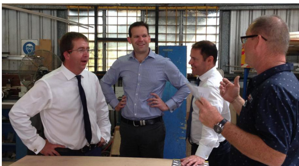
The 2015 budget is good for small to medium-sized business like this caravan manufacturer I visited on the Sunshine Coast with fellow LNP Senator James McGrath (left) and Assistant Treasurer Josh Frydenberg.

The measure builds on our more than $333 million in targeted support for farmers and communities impacted by drought announced by the Prime Minister in Longreach on May 9, taking