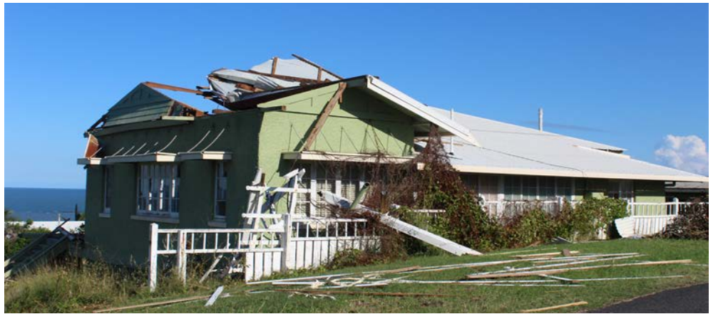
More than 1,500 homes were damaged in the region.

I want to pay tribute to the leaders and to the entire community who, through their efforts, their quick responses and their listening to the authorities on what they needed to do, made sure that no-one died, fortunately, in this event and no-one was even seriously injured — a remarkable outcome given the strength and force of the cyclone.